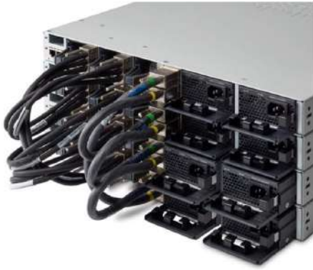
Figure 7. Cisco Catalyst 9300 Series StackPower