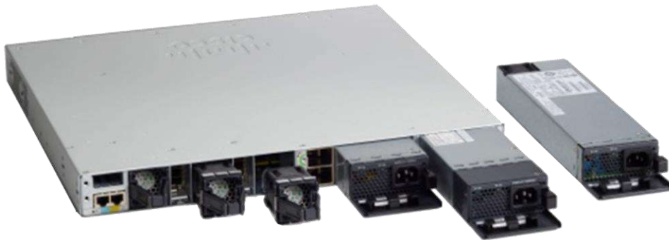
Figure 4. Cisco Catalyst 9300 Series Dual Redundant power supplies

Cisco Catalyst 9300 Series switches support dual redundant power supplies. The switches ship with one power supply by default, and the second power supply can be purchased when the switch is ordered or at a later time. If only one power supply is installed, it should always be in power supply bay #1. The switches also ship with three field-replaceable fans. Power Supplies are common across the Catalyst 9300 Series.