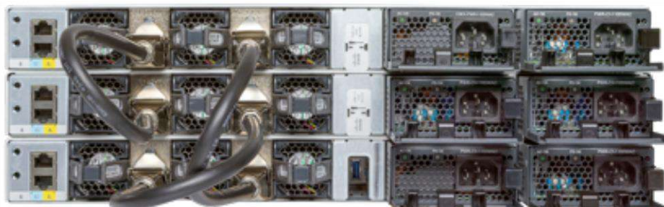
Figure 6. Cisco Catalyst 9300 Series fixed uplink models with optional stack kit