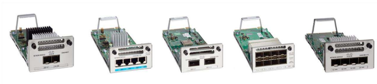
Figure 3. Cisco Catalyst 9300 Series Network Modules